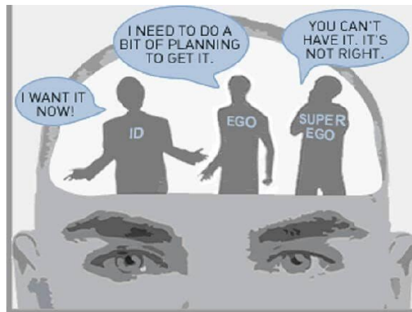
Figure 2. Sigmund Freud’s Concept of Id, Ego, and Superego

Finally, Lawrence Kohlberg explained it in the form of moral development as the pre-conventional, conventional, and post-conventional stages that take place in one’s life.